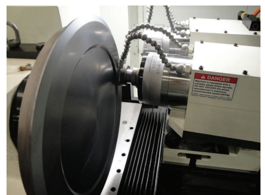
Spindle set at a 5 degree angle for face grinding operation