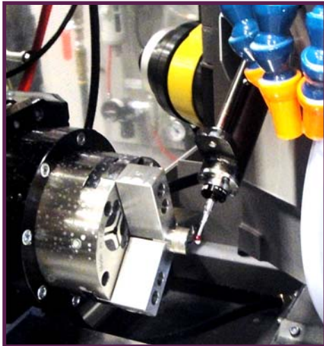
Automatic lateral locator with Renishaw probe