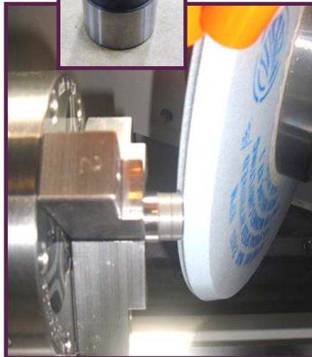
4" MicroCentric chuck and Norton grinding wheel