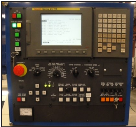
Operator panel featuring a FANUC 21i CNC control

Unique grinding application demands sub-micron tolerances. Major manufacturer of precision spindle components selects the Weldon UGC for a challenging application. This project involves OD, ID, & face grinding on a various spindle shafts. With this machine configuration multiple operations or rough & finish grinding can be accomplished in a single set-up. The system features custom work holding, GMN high-frequency grinding spindle, Setco low frequency grinding spindle, Spindel & Toshiba variable speed drives, Turmoil spindle chiller, Vogel spindle lubrication, & Meister rotary dresser.