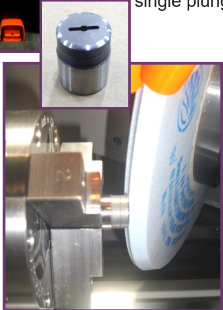
4" MicroCentric chuck and Norton grinding wheel