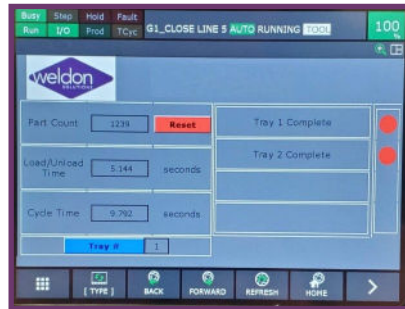
Custom Robot HMI Operator Interface