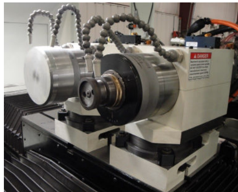
(2) GMN 150mm 24,000 RPM spindles with diamond grinding wheels